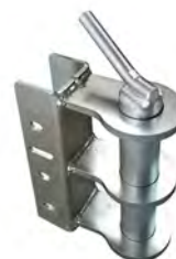
DROP PIN Ø38 MM