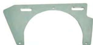
10 KG BALLASTS