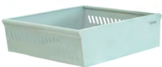
BASKET 730X730XH220 MM